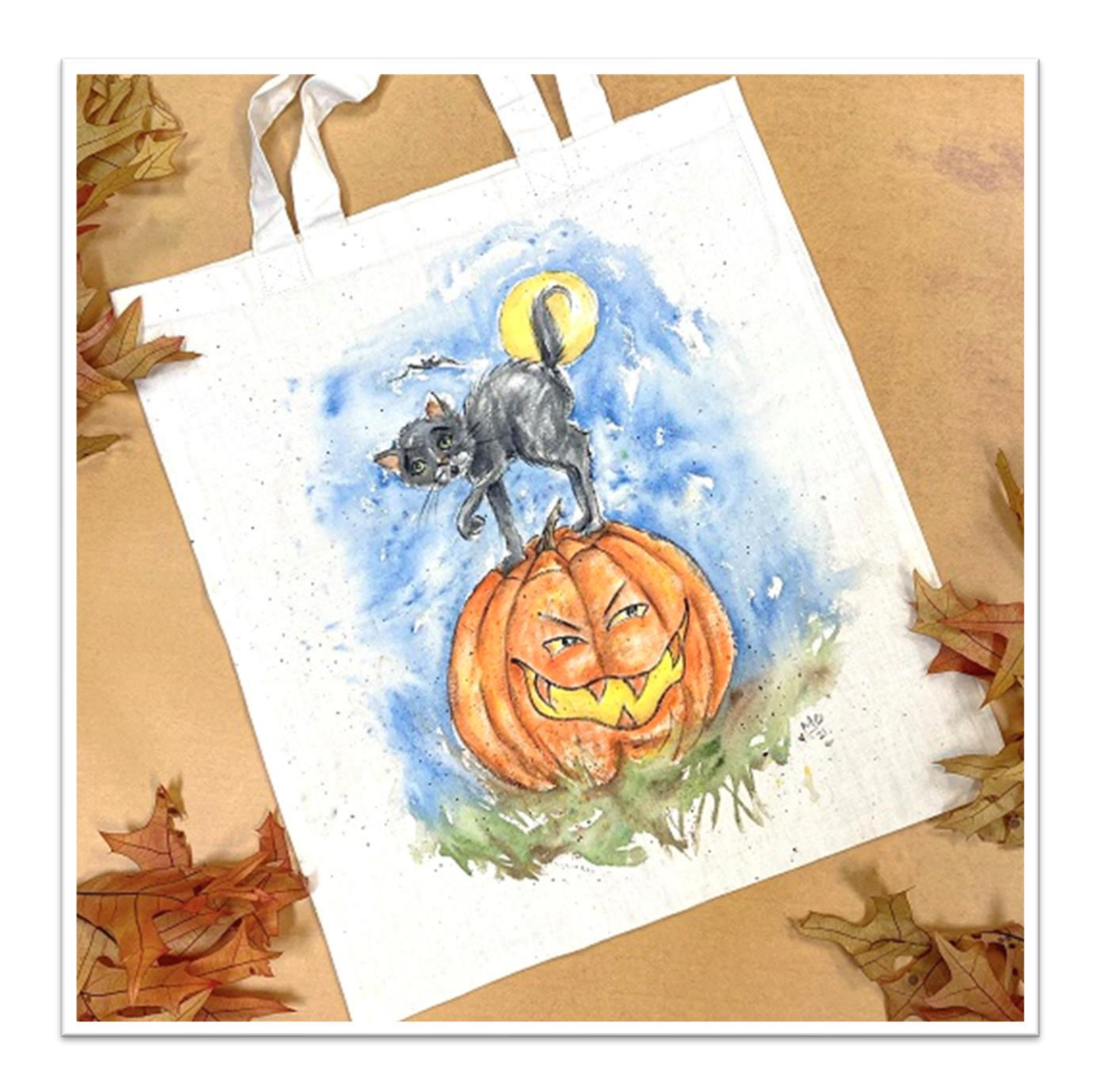
Scaredy Cat and Pumpkin – Tote Bag