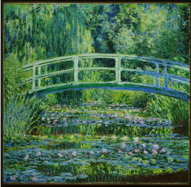
Water Lilies and Japanese Bridge,1899.

The students will be using DecoArt's Wax Effects Paint which simulates encaustic painting. This paint will help the students to achieve a technique similar to the Impressionists.